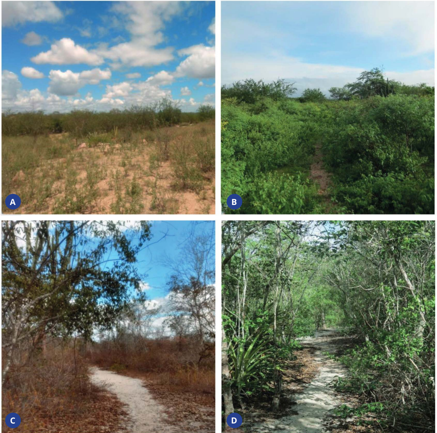
Figure 25. Studied areas of open scrub caatinga vegetation located in northern Bahia state, Brazil. A-B. Povoado Rio do Sal, Paulo Afonso, Bahia: dry season (A), rainy season (B); C-D. Fazenda Mundo Novo, Canindé do São Francisco, Sergipe: dry season (C), rainy season (D).